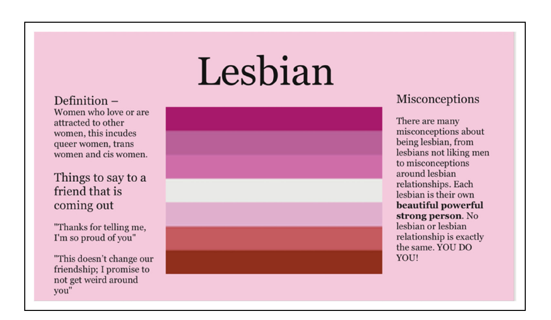
Figure 2. Sexuality poster produced by students.

Pākehā participants also enacted their citizenship within their own lives. They explained that, as a result of learning about MeToo^5 in their social studies class, they took these conversations into