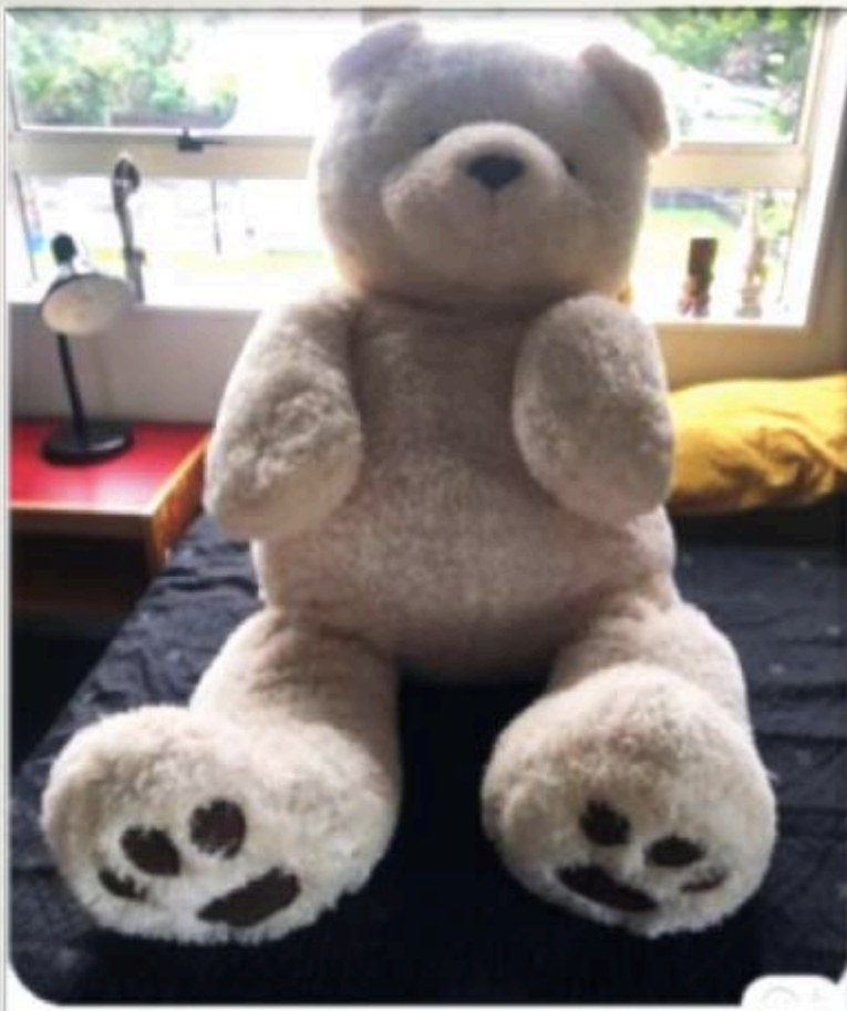
Winny of Paroa