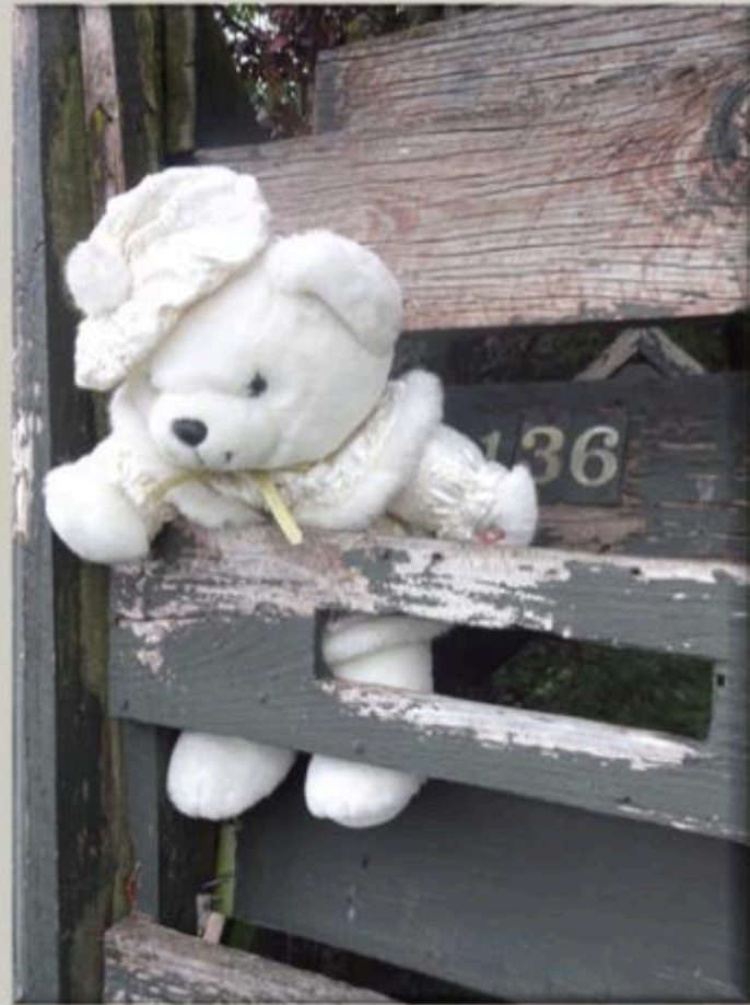
Missy at No.136