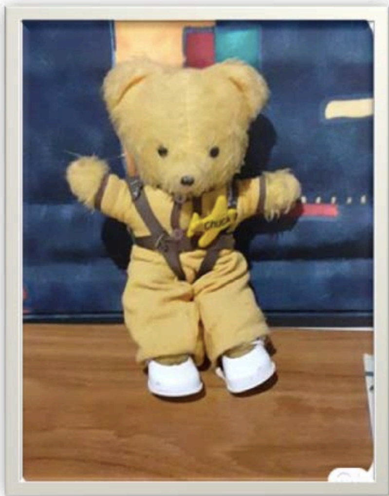
Chuck the Flying Ace